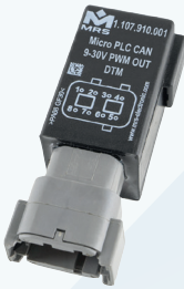
Micro PLC CAN DTM