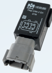
Prop CAN 2CH DTM