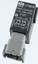
Motor Controller 7.5 A CAN DTM