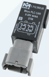
Micro PLC CAN 4 ANA DTM